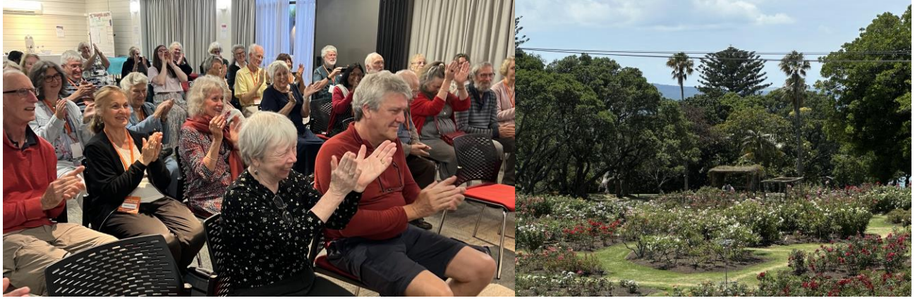
A special evening at the Rose Park...so much love and gratitude all round!