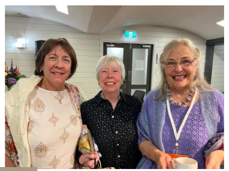
Simply the best...